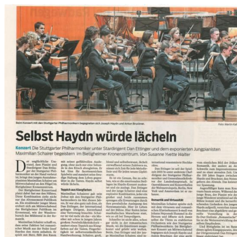
- Südwestpresse + Bietigheimer Zeitung, 04.10.2019

»Full house with first-class piano art ...« - Kulturreport Bayreuth, 05-11-2023